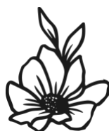
Exhibit 4. “Jumpin’ at the Woodside” (Perennial Crops)

Exhibit 3. “Orchids Grown in New Mexico”