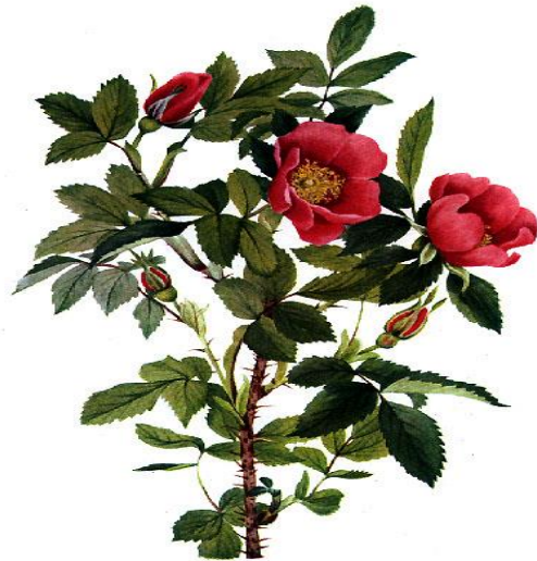
Wild Rose - Rosa bourgeauiana